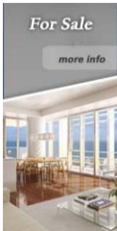
www.meier.co.il/Luxury_Apar Ads by Google